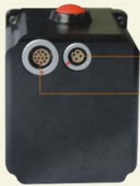
Power connector Video/Control/RS232 connector

D760 series is designed to be a low cost good quality infrared imaging module. Featured with low power consumption, low noise, ultra-compact and real-time thermal video surveillance (50Hz), DL760 offered continuously infrared thermal imaging video output under wide operating temperature range and image storage function, which meets variety application including industry medical electronic, research, public safety and etc.