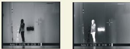
Hotblack/hotwhite reverse display