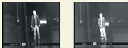
Multi user-defination image mode